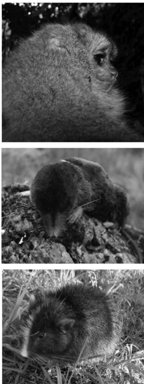
FIGURE 1. NEW SPECIES OF ANIMALS DISCOVERED IN THE LAST DECADE

Newly described species have been discovered in the most unusual places such as a 3 km deep gold mine, in the bottom of the ocean at 10 km deep, in the frigid water of Antarctica, and the sand dunes of Namibia (e.g., Ceballos et al. 2010). Some new species are so unique that there is no agreement among specialists where to